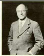
Karl Polanyi, 1967